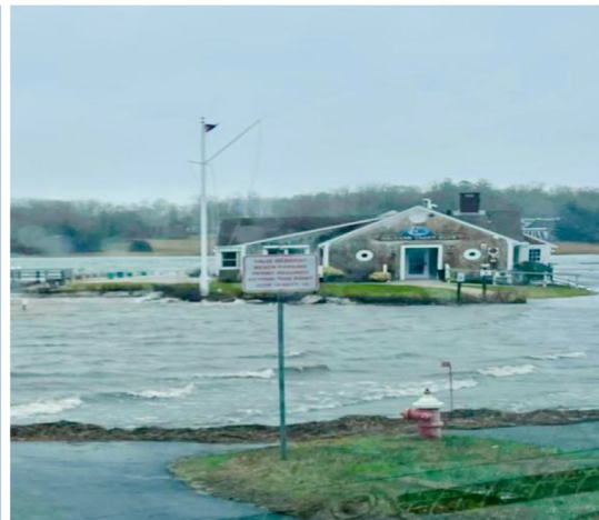
Orleans Yacht Club post storm surge 2024

Organized By: Orleans Marine and Fresh Water Quality Committee